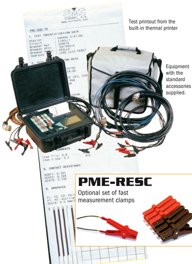
Test printout from the built-in thermal printer