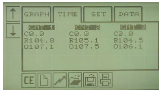
Numerical results display