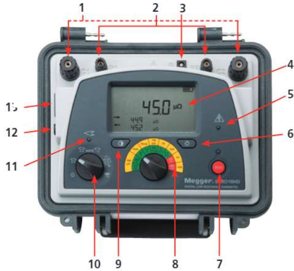
DLRO10HD Instrument Overview