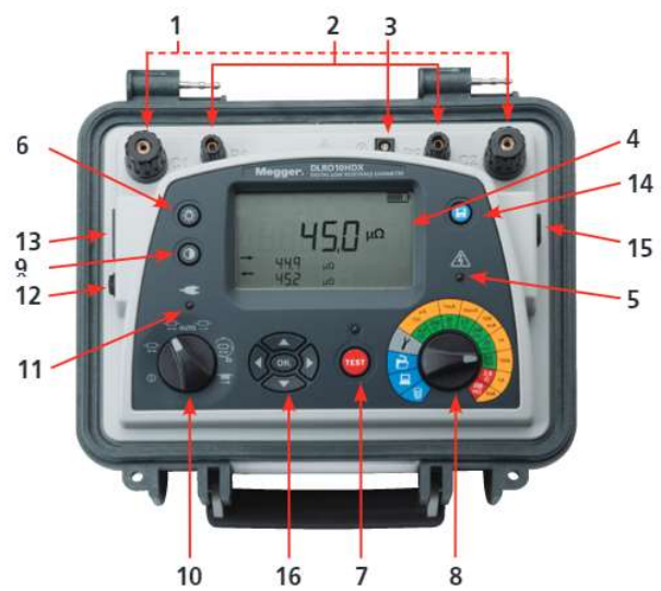
DLRO10HDX Instrument Overview