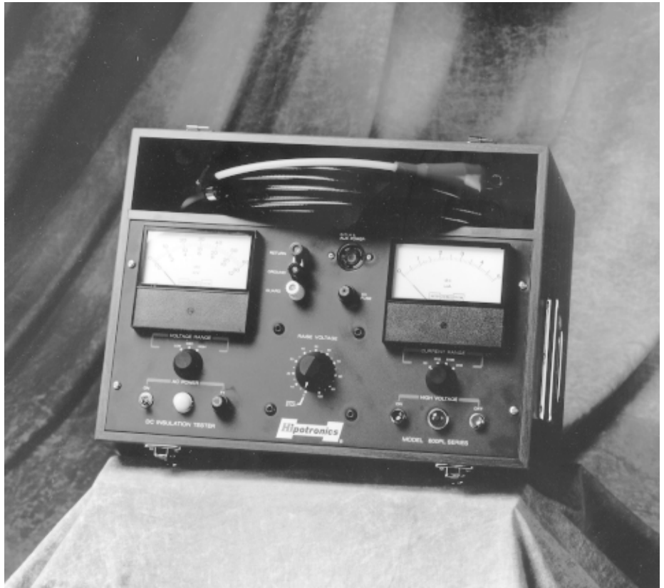
Model 880PL DC Hipot Tester