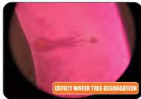
DETECT WATER TREE DEGRADATION