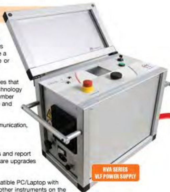
HVA SERIES VLF POWER SUPPLY

With some test instruments on the market, you spend more time generating a test report than you do performing the actual physical test. At the click of a mouse, the Tan Delta Control Center generates a report within seconds of completing a test in either a summarized single page or detailed multiple page format. Each TD test can be saved electronically in PDF, CSV or XML Excel™ file format. TD Test reports can then easily be stored, emailed, printed or additional analyzed.