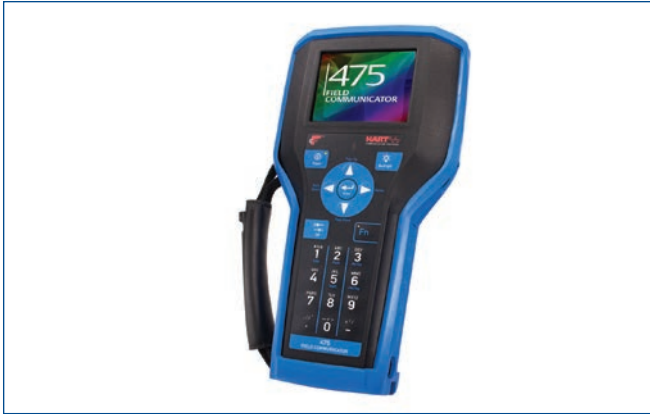
The protective rubber boot provides added protection in the field.

The intuitive user interface makes ValveLink Mobile easy to use and understand. Diagnose issues in the field or transfer the results to an asset management system like AMS Suite for in-depth analysis and documentation.